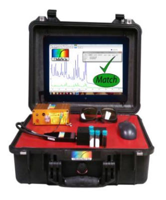
Rugged Case for "Open & Measure" Applications

The system collects your sample's Raman spectrum and sends the spectral data to a tablet with factory installed SpectraWiz ID^{TM} Software for spectral matching. Users may create their own sample library from which to search OR they may join our Raman Library Share program to gain access to our Free Raman Database.